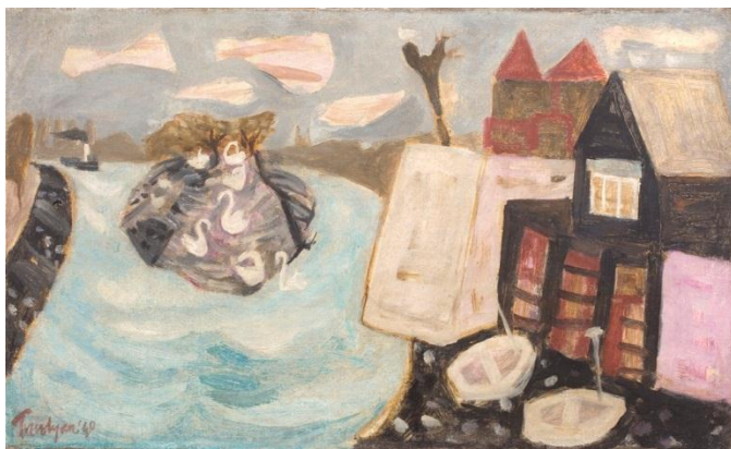
Julian Trevelyan, House on the Thames , 1940

T +44 (0) 20 7242 4443, d.archer@austindesmond.com